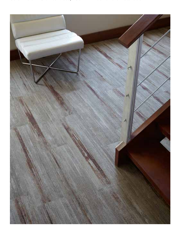
Color Field in Barnwood, 25cm x 1m ashlar tile installation