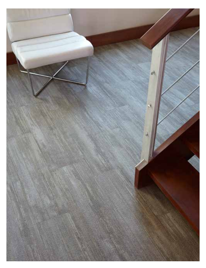
Color Field in Birch Shadow, 25cm x 1m ashlar tile installation