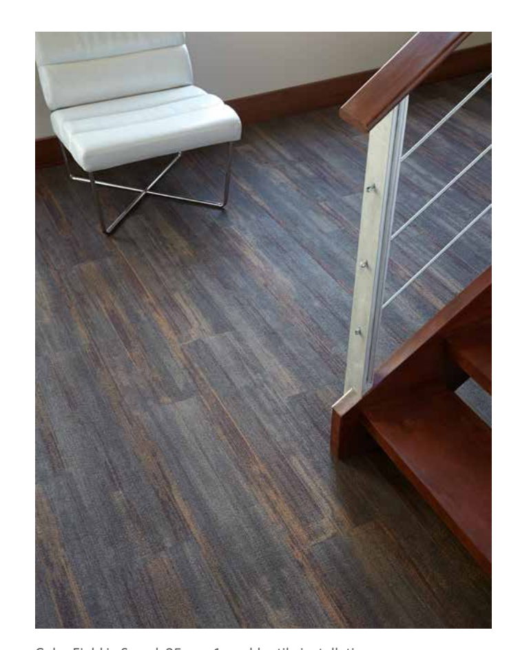
Color Field in Sorrel, 25cm x 1m ashlar tile installation