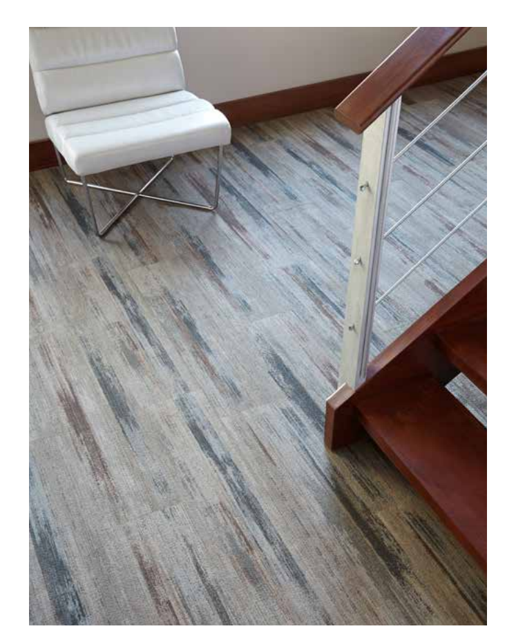
Color Field in Granite Moss, 25cm x 1m ashlar tile installation