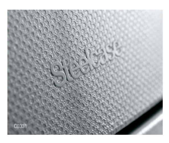
TEXTURED LOOK AND FEEL ON THE SEAT BACK