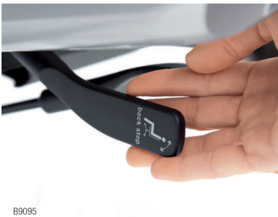
BACK LOCK IN FORWARD POSITION