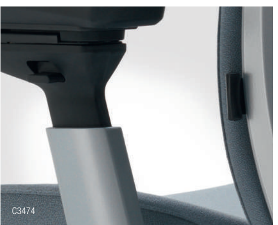
ADJUSTABLE DETAILS TO MAXIMUM COMFORT