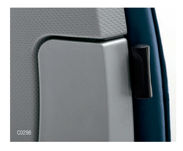
UPHOLSTERY FINISHING AND TEXTURE BACK