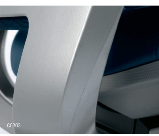
ELEGANT AND STYLISH FINISHING