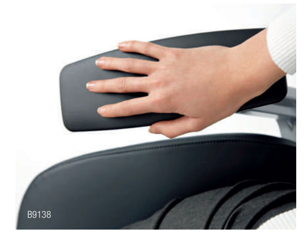
AMREST WIDTH, DEPTH, PIVOT AND ANGLE